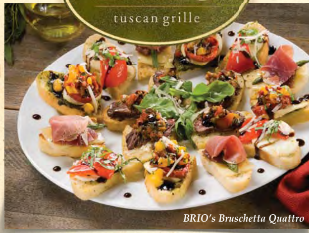
BRIO's Bruschetta Quattro